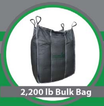
2,200 lb Bulk Bag