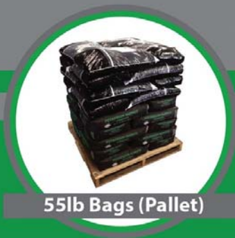
55lb Bags (Pallet)

Our products are manufactured for worldwide distribution, with production capacity capable of meeting agricultural, horticultural, turf, ornamental, and hydroponic market demands around the globe.